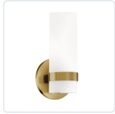
WS9809-BG Brushed Gold