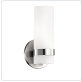
WS9809-BN Brushed Nickel